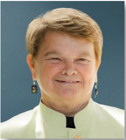
Sheila Kuehl 3rd District