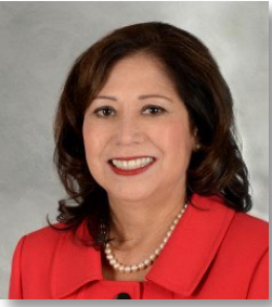
Hilda Solis 1st District